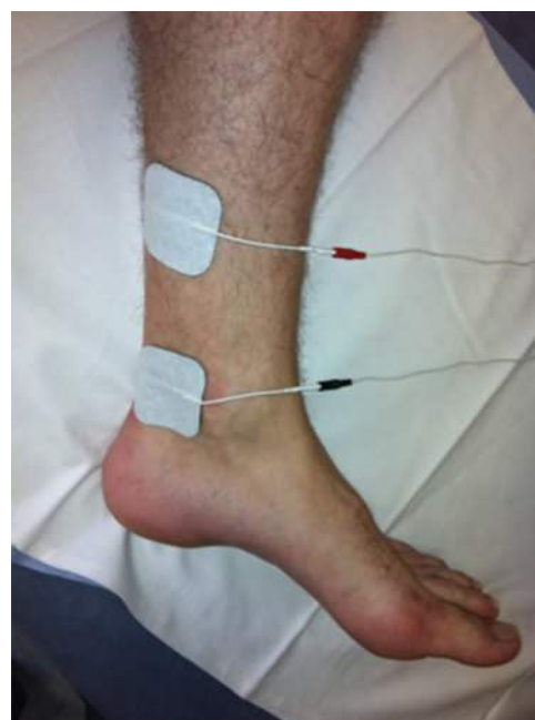
FIGURE 1. Photograph to show position of electrode pads.